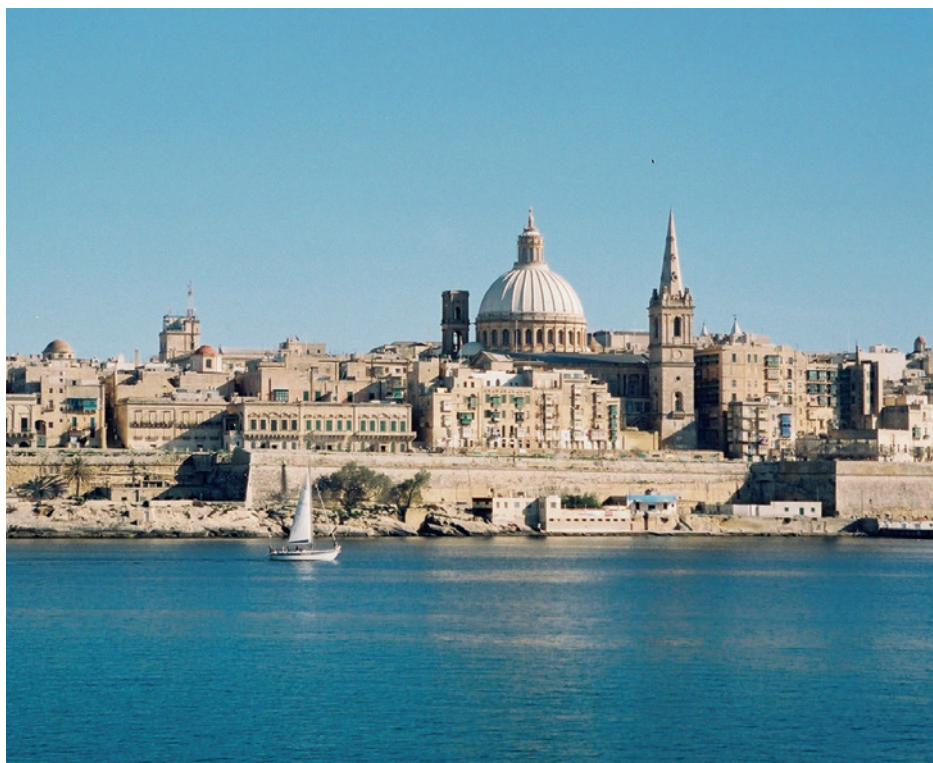
St. Paul's Pro Cathedral, Valletta, Malta

For this year's Week of Prayer for Christian Unity, we accompany the churches of Malta, praying with and alongside them, praying also for them in their Christian journey as they seek the unity for which Christ prayed. And we rejoice with them that Malta traces its Christian origins back to the time of the Apostles. And in so doing, we enter into the drama of St Paul, those that travelled with him, and the inhabitants whom they met, to discover our shared unity, and in so doing recognise the importance of unusual acts of kindness that bear witness to the Gospel of peace and reconciliation.