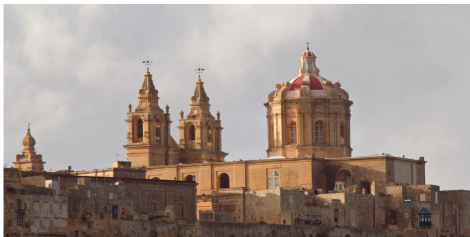
St. Paul's Cathedral, Mdina, Malta

The story of St Paul's being shipwrecked on Malta in Acts 27 and 28 leads us, during this Week of Prayer for Christian Unity, to reflect upon many aspects of our own lives and the lives of our churches. As we approach one another, seeking unity, we recognize that we sometimes carry baggage from history, tradition and cultural expectation, which can weigh us down and threaten to overwhelm us. There is the danger that, in the face of that experience, we might