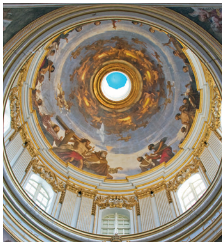
St. Paul's Cathedral, Mdina, Malta

Almighty God, our personal suffering leads us to cry out in pain and we shrink in fear when we experience sickness, anxiety or the death of loved ones. Teach us to trust You. May the churches we belong to be signs of Your providential care. Make us true disciples of Your Son who taught us to listen to Your word and to serve one another. In confidence we ask this in the name of Your Son, and in the power of the Holy Spirit. Amen.